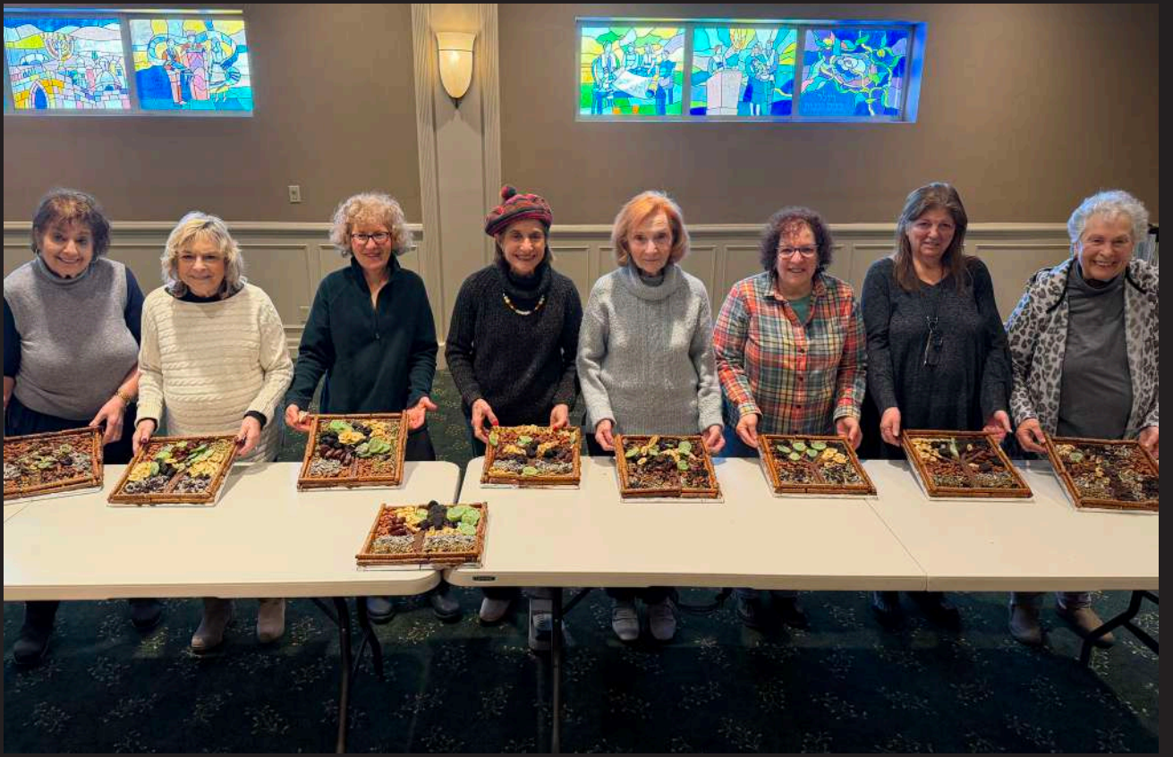
Temple Beth Torah celebrated Tu B'Shvat with a craft event, where participants made an edible seder plate and a fruit tree picture frame, and a seder, where we celebrated with singing, learning, and delicious food.